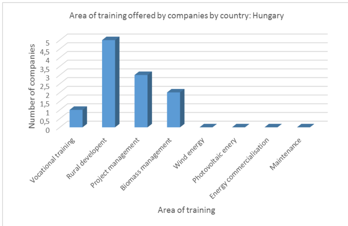
Figure 4. Area of training offered by Hungarian companies

As it could be observed from the figures (fig.1-fig.4), the companies participating in the project network cover a large area of activities. The majority of them are specialised in rural development and project management, four work especially in renewable energy, one in energy efficiency and the other two in agricultural development and respectively, in organic products biomass.