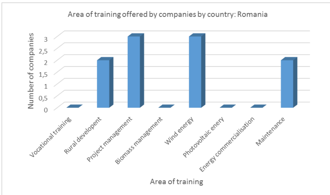
Figure 3 Training area of Romanian companies