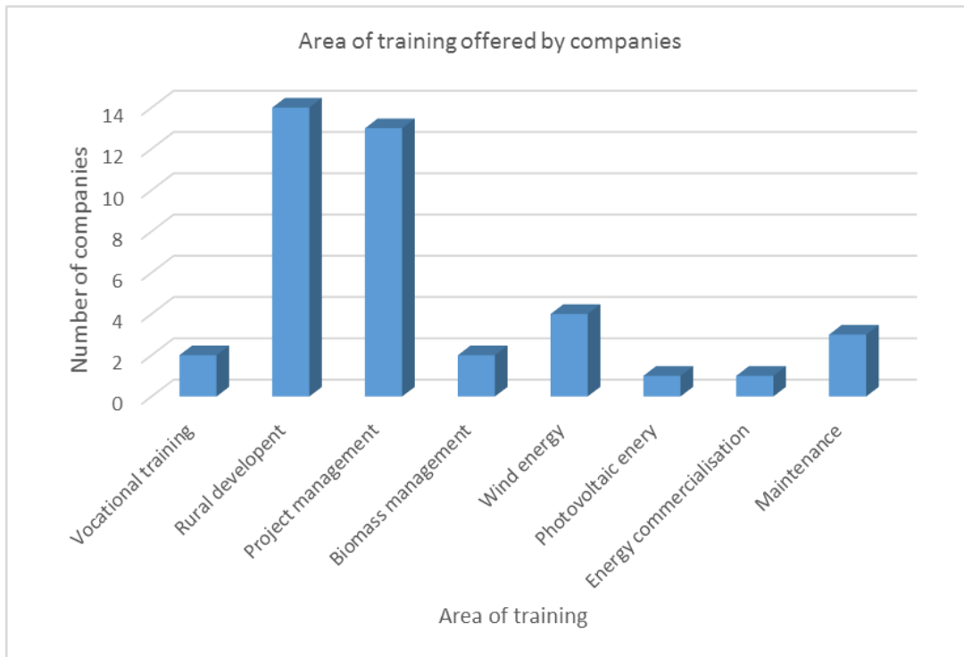
Figure 2. Area of training offered by companies