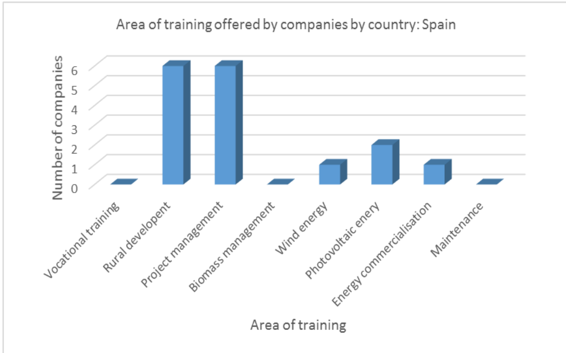
Figure 3 Training area of Spanish companies